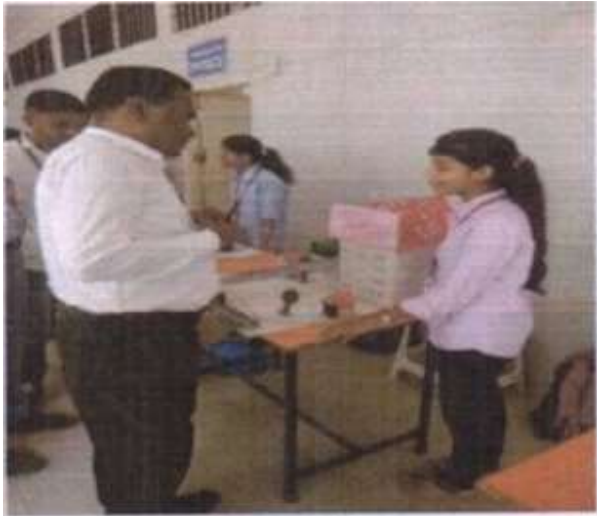
Student demonstrating experiments and working models